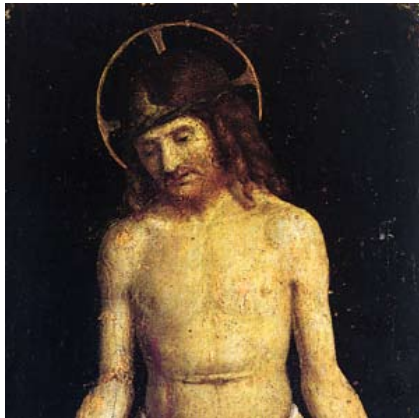
Giambattista Cima da Conegliano, Dead Christ , oil on wood

The altarpiece was evidently intended for the small private chapel of a family whose members are shown in the painting. It is important to underline the exceptional quality of the pictorial execution and the stupendously effective portrayal of sentiment. Jacopo is extremely skilled in overcoming the restrictions created by the forced dimensions of the painting. He here gives particular relevance to the now lifeless body of Christ, slumped forward, almost on the diagonal, and this allows him to insert the figures of the donors and that of the Magdalene on the right, offering excellent proof of his splendid portraitist skills.