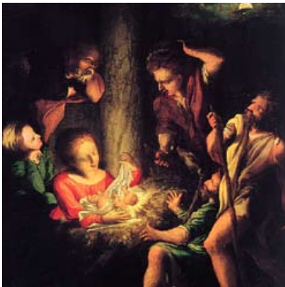
Lelio Orsi, Adoration of the Shepherds , oil on wood