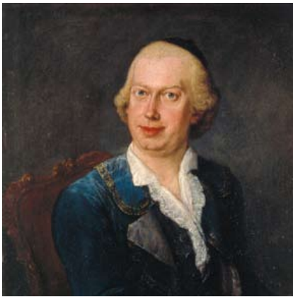
Alessandro Longhi, Portrait of Giuseppe Chiribiri (Cherubini) , oil on canvas