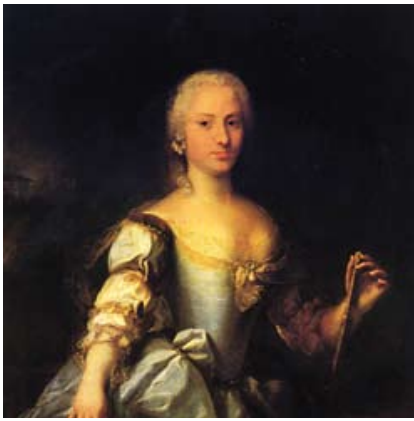
Jacopo Amigoni, Portrait of a Young Woman (the 'debutante') , oil on canvas